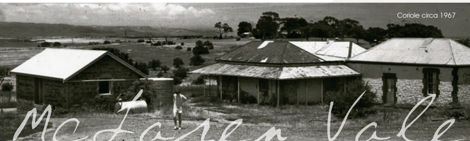
Coriole circa 1967

Coriole Chenin Blanc 2007 and Coriole Contour 4 Sangiovese Shiraz 2005 have made the Sydney International Top 100. This is a great result for both wines given that 454 brands from 18 countries worldwide are entered. Unlike most wine competitions, the Sydney International judges the wines alongside food. No surprise Coriole showed well!