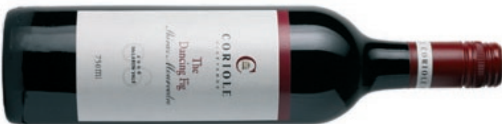
2006 The Dancing Fig