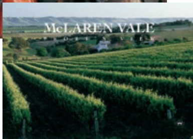
Right: McLaren Vale, Trott's View , published by Wakefield Press.