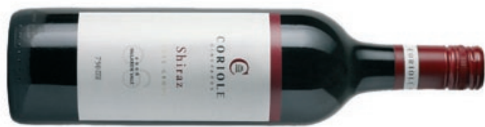
2006 Estate Shiraz