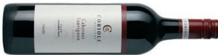
2006 Estate Cabernet