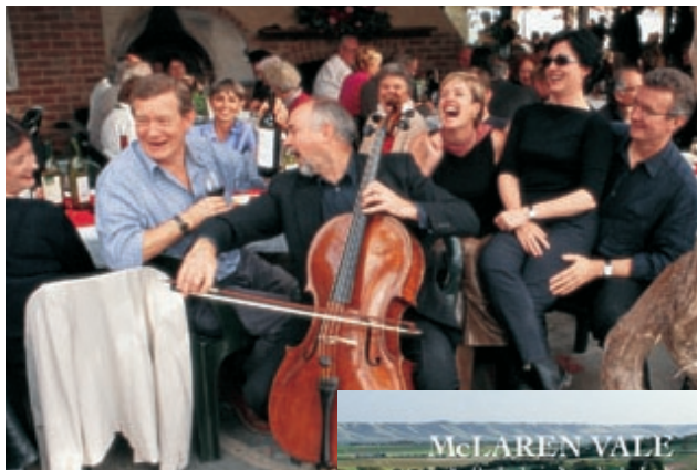
Above: Photograph taken from the book, McLaren Vale, Trott's View .

Our early picked Shiraz and Cabernet both look exceptional. However some fruit taken late in the heatwave was very ripe and will need to be declassified from Coriole labelled product.