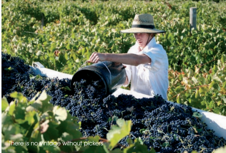
There is no vintage without pickers

Size of fruit also has a role in flavour. While gourmet delis snap up the 'Jumbo' size olives, some of the most flavoursome fruit is the smaller size that we place in vacuum packs. I was reminded recently that this may frequently occur with other fruit when an apple grower complained that the supermarkets only take the larger apples and the 'smalls' are confined to a juicing price, yet he said, "This is the only apple I would ever eat".