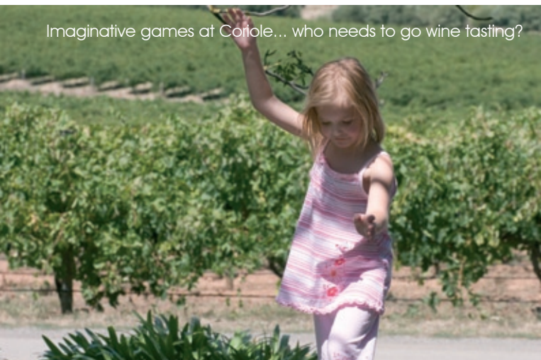
Imaginative games at Coriole... who needs to go wine tasting?

CORIOLE ONLINE | Contact us - contact@coriole.com - with your email address and we'll keep you updated with all things Coriole!